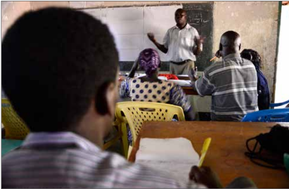
An adult education class for refugees in Kenya's Kakuma camp.

forced to work informally and, in some cases, submit to exploitative labor conditions in order to survive.