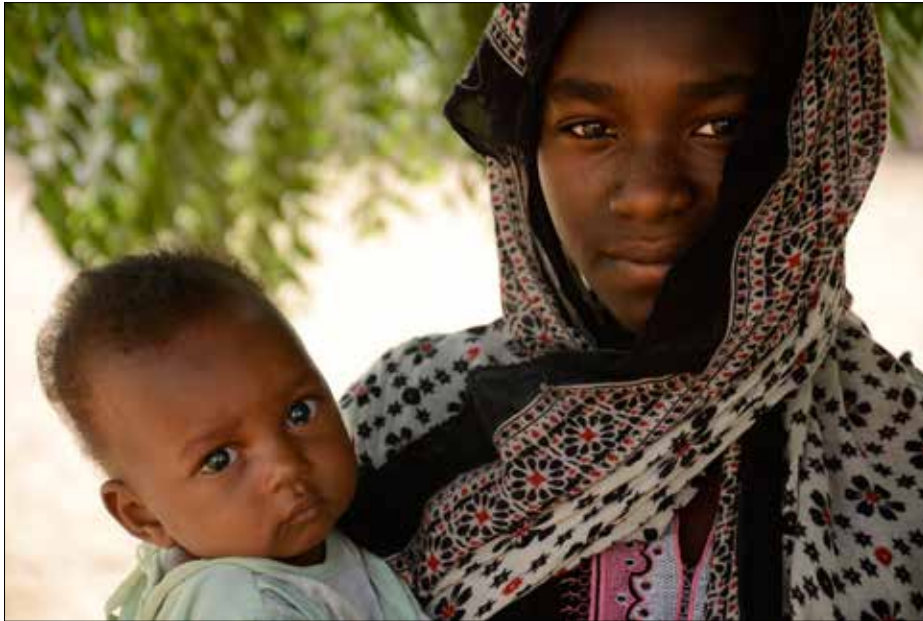
JRS works to ensure women with children have access to school.

their children. And, on the other hand, individuals are discouraged about completing their education when there are no opportunities for employment.